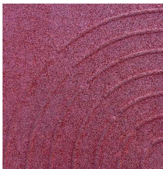
Hexdalle® Tactile R