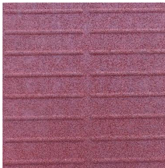
Hexdalle® Tactile L